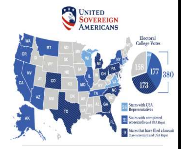
2022 Aggregate data for 21 states with completed scorecards*

security number, driver license number, state ID number or signature are missing. They are illegitimate and were not to be counted. USA's evidence proves otherwise.